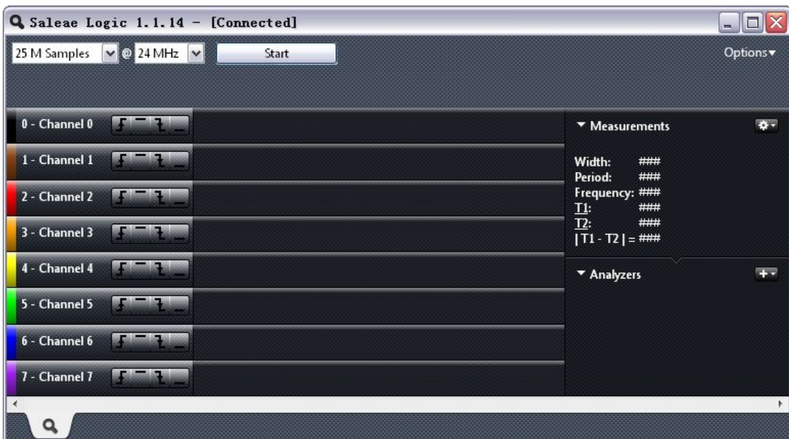
Figure 7.1 Saleae Logic interface